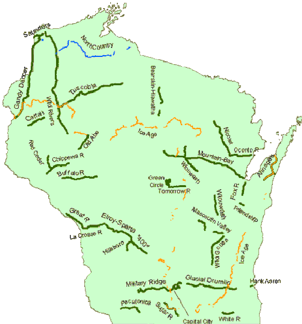
Drawing from the DNR WEB Site

WisDOT also has downloadable bike maps for each of Wisconsin's 72 counties . This approach enables cyclists of all abilities to select their own routes to meet their individual transportation and recreational needs. WEB site is ( http://www.dot.wisconsin.gov/travel/bike-foot/bikemaps.htm )